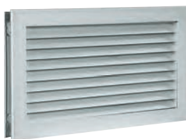
AC 181 - Aluminium