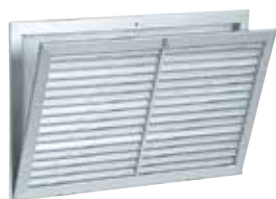
AC 161 W - Aluminium