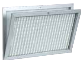
AC 163 W - Aluminium