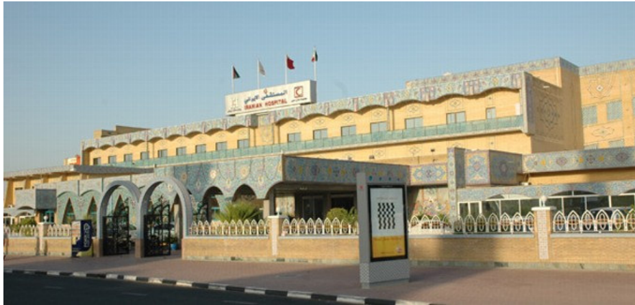
Iranian Hospital - extension (Al Wasl street, Dubai)

Set up since 1973 in Dubai, the Iranian Hospital represents an excellent healthcare in the GCC region. As the United Arab Emirates develops at a rapid pace, hospitals need to cover the increase of healthcare issues of more than 150 nationalities.