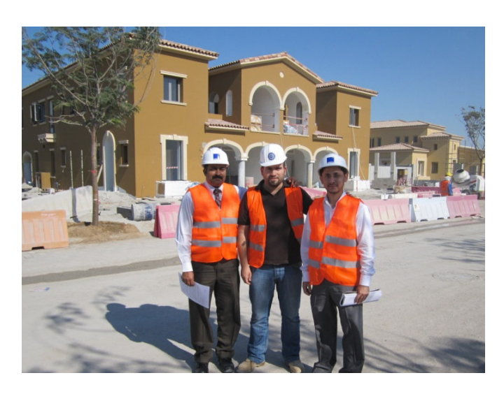
A full commitment towards our clients (Otak International), consultants (White Young emirates) and contractors (Al Jaber Building LLC - ETTS) – Aldes & ETTS representatives during a site visit

Consequently, Aldes ME will continue to provide the best support and solutions to the UAE market to enhance the Safety & Indoor Air Quality in any housing project.