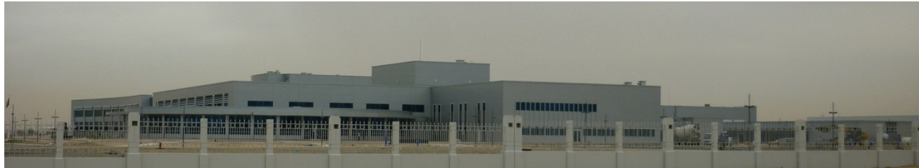
Umm Al Quwain General Hospital – Construction Site